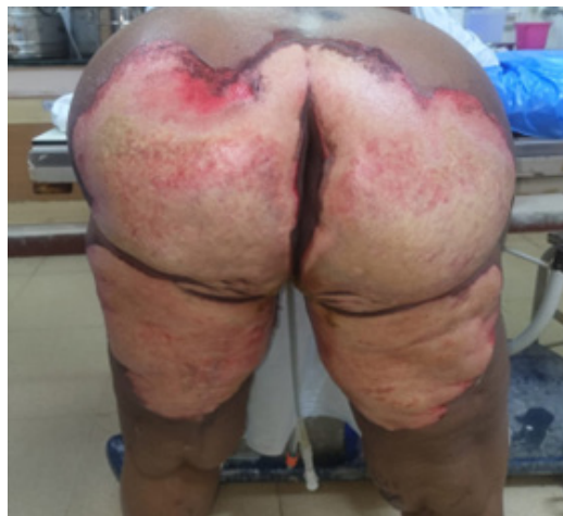
Figure 1. Showing thermal burns over the gluteal region at time of presentation BJWAT Score 48

The wounds responded to treatment with Super Oxidized Solution, and exhibited healthy granulation following local treatment with Super Oxidized Solution. As the wound bed condition improved, it facilitated performing skin grafting (Figure 3). The study documented the status of bacterial growth, time required for wound sterility, granulation appearance, healing duration, and any associated complications.