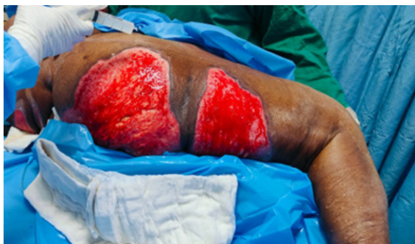
Figure 5. Figure showing condition of the wound after utilization of super oxidized regenerative therapy (BJWAT wound score - 32)