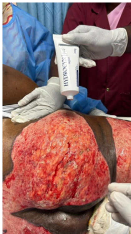
Figure 2. Showing application of super oxidized solution over thermal burns over the gluteal region