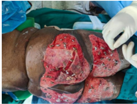
Figure 3. Showing full thickness skin stamp graft with dermal matrix scaffolding with amniotic membrane application. (The wound bed preparation was enhanced by the routine use of superoxidized solution)