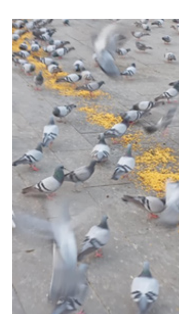
Plate 2. Pigeons are eating.

Nesting sites and shelter: The government of Saudi Arabia has established some towers for these pigeons as nests or common shelter. The reproduction rate is higher and their numbers are increasing day by day. Due to sufficient feed, and less natural calamities especially flood, pigeons are passing well. Local people do not kill them or take them as protein consumption due to religious aspect. In Bangladesh, railway