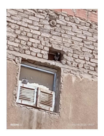
Plate 3. Nesting sites.

Diseases and mortality rate: Phenotypically, all pigeons looked healthy. Some were sick by appearance. Free-living pigeons of Saudi Arabia may not play an important role in the infections occurred in the community due to low incident of E. coli and Salmonella pathogens [11]. According to the local people, there are few mortalities rate was found in these pigeons (3 death record were found in 3 years). While crossing the road by walking or flying, sometimes, pigeons were killed by vehicles. This type of incident is available in Bangladesh too [12].