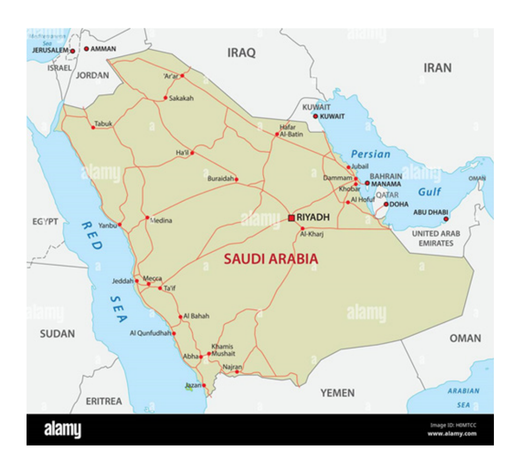
Figure 1. Location of Mecca and Medina (for rock-pigeons) in Saudi Arabia [7].