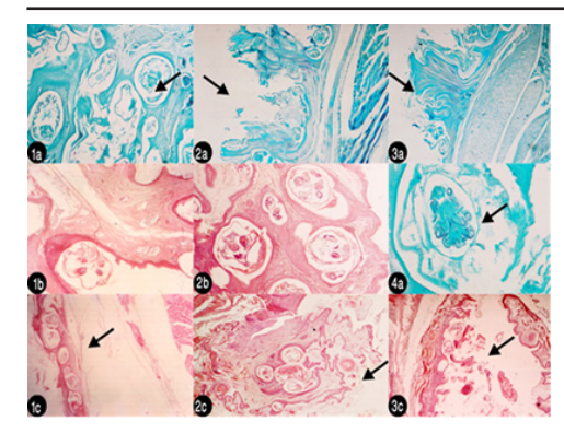
Figure 2: Histopathological lesions

(1a): Deep layer in leg epidermis showing all burrowing mites imbeddedin dermis and cause lesion like cavities and different stages of K. pilae x 500 stained with malachite green 1%; (2a) Ultrathin section in leg showing hyperplastic dermis with mild perivascular cell infiltration and edema in the reticular layer x 125 stained with malachite green 1%; (3a) ultrathin section in beak showing the same pathogenesis like happened in leg x 125 malachite green; (1b) H&E histopathological section in beak x 500 showing pouch-like cavities; (2b) Ultrathin section in beak stained with DMSO- x – 500 showing many gravid females forming "honey combed" lesion of many cavities; (4a) Ultrathin section stained with malachite green x-500 ventral aspect of larva in deep layer of stratum corneum; (1c) H&E –x- 125 in leg and its muscle.