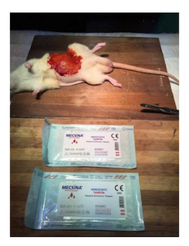
Figure 3: Left flank incision was performed