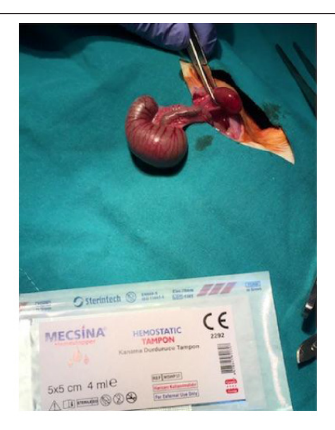
Figure 4: Prior to partial nephrectomy.