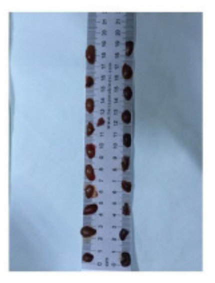
Figure 1: A total of 20 partial nephrectomy image, material size are close together.

formation, red blood cells enter into the network formation that provides more oxygen to the bleeding area resulting in a fast tissue recovery. In this study, we aimed at analyzing the efficacy and reliability of Mecsina hemostopper as a safe hemostatic medical device.