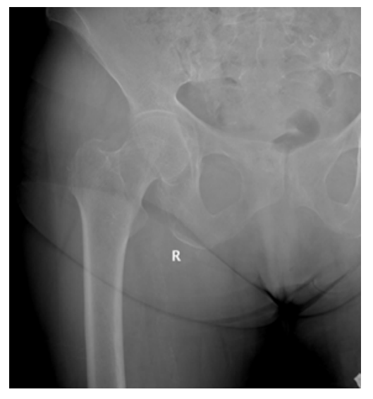
Figure 1: First visit right hip X- ray anteroposterior view. No signs of femoral neck fracture.

The patient had been evaluated one year earlier for a right inguinal pain of mechanical characteristics. Physical assessment was unspecific: range of motion was complete and pain free with no shortening of the right lower limb. Inguinal palpation was painless. Pelvic radiographs showed a stage I-II right coxarthrosis (Tönnis classification) [8,9]. The patient was managed with pain killers. The patient was referred again for consultation due to lumbar pain with irradiation to the right inguinal region. She referred an insidious mechanical lumbar and inguinal pain during the last months. She did not report any traumatic event nor a trigger factor for that pain. The physical assessment showed lumbar pain, and rotations of the hip were painless. The hip X-ray at that stage showed no signs of femoral neck fracture (Figure 1). The lumbar spine X-rays were also normal. She was prescribed treatment with nonsteroidal anti-inflammatory drugs and physiotherapy for the lumbar region.