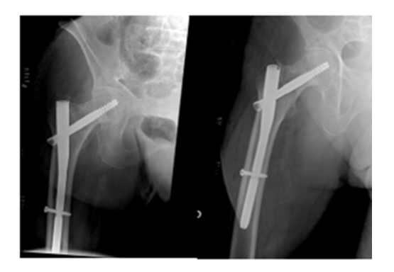
Figure 4: Post-op X-ray: intramedullary fixation with a proximal femoral nail.

the patient started walking with the help of a walker. She was discharged home without pain three days after the operation.