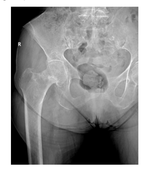
Figure 2: Right hip X-ray: incomplete stress fracture in the middle of the superior aspect of the right femoral neck.

5° and external rotation of 25°. The new hip X-ray showed an incomplete stress fracture in the middle of the superior aspect of the right femoral neck, located at the tension side (Figure 2). A hip MR confirmed the presence of an incomplete stress fracture of the right femoral neck. This fracture produced a decrease of the neck-shaft angle: (1270 right side, 1370 left side). There was also slight unexpected bone edema at the acetabulum roof level, probably caused by trabecular contusion (Figure 3).