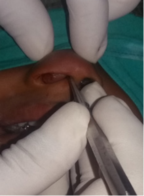
Figure 1 a: Nasal swelling [RT alar hematoma] b] Probe testing of nasal

Then we decide to do routine investigation like the complete blood count and chemical analyses like random blood sugar level, kidney function test and liver function test and they showed no abnormalities and did not reveal any blood dyscrasias. The computed tomographic scan revealed irregular borders of the distal right nasal cartilage accompanied by severe swelling of the soft tissues on the dorsum of the nasal pyramid, with prominence toward the right Figure [2].