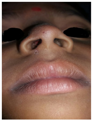
Figure 5: F/U image showing normal nasal cavity.

Histologically we found severe chronic inflammatory changes consistent with mature lymphocytes that were dispersed, with granular tissue and neovascularization. Granular post-traumatic tissue with-out any microorganisms was reported. The patient demonstrated significant aesthetic improvement within 10 days postoperatively, at 2-month follow-up, the patient continued to experience no problems figure [5].