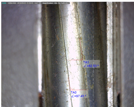
Figure 3: The digital measurements from the inside of Pistol A were acquired for the interior angle (the rifling angle) of 82.53° and the exterior angle of 97.45°.

With the quasi-experimental design, the cut-half barrel from Pistol A was measured from a vertical position (top-down) using the digital device at a magnification of X 32 for the best focus and a working distance of 44 mm (See Figure 3). Two angles were achieved with the interior angle of 82.53° (the smaller angle) and the exterior angle of 97.45° (the larger angle). The sum of the two angles is 179.98° with an error of .02, thus meeting the semicircle theorem: Interior Angle + Exterior Angle = 180°. For the sake of consistency with the latter rifling angles from the four bullets, the interior angle was used as the rifling angle for comparison. The two angles were verified manually with a semicircle ruler for 82.50° and 97.50°.