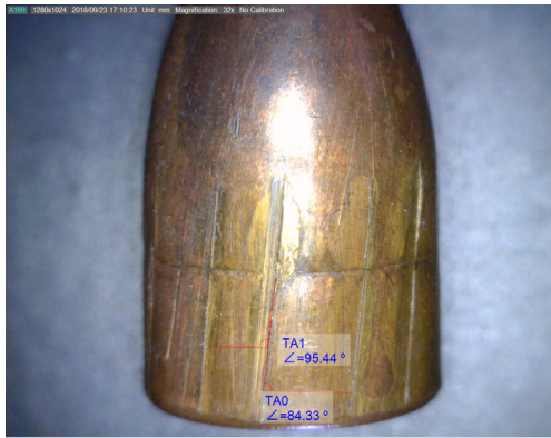
Figure 8: Two digital measurements from Bullet D were acquired for the interior angle (the rifling angle) of 84.33° and the exterior angle of 95.44°.

Table 1 provides the four rifling angles from the four fired bullets (9 mm) with an error margin +/- > 0.5. From Table 1, three conclusions can be presented. First, an exclusion can be reached with high certainty that the four bullets were fired from four different pistols due to their different rifling angles. Second, Bullet C was probably fired by Pistol A (its rifling angle 82.53°). However, a comparison of the other five criteria is needed for a final determination. Finally, the study indicates that the rifling angle may suggest a new direction of examination to determine at least if the CE 399 was not fired by the CE 139 in the famous J.F.K. assassination case if the two rifling angles are different.