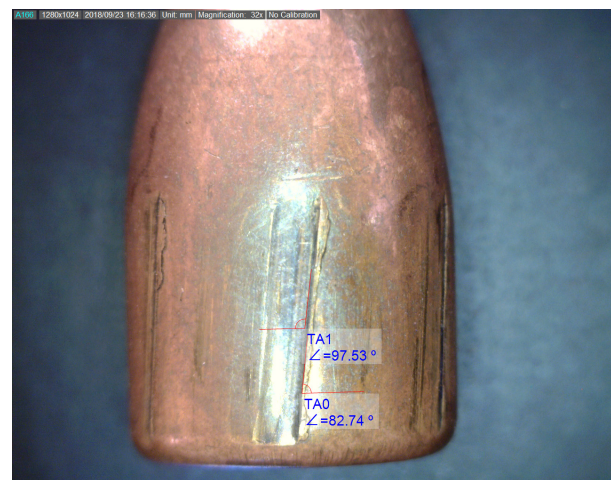
Figure 7: Two digital measurements from Bullet C were acquired for the interior angle (the rifling angle) of 82.74° and the exterior angle of 97.53°.