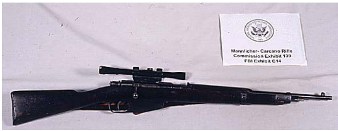
Figure 1: The murder weapon determined by the Warren Commission's Report.

spiracy theories surrounding the assassination. Subsequent investigations as well as some research projects have shown different results and called to question the two reports.