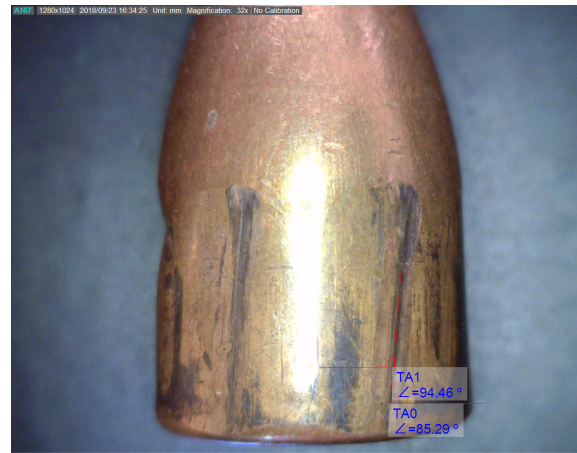
Figure 5: Two digital measurements from Bullet A were acquired for the interior angle (the rifling angle) of 85.29° and the exterior angle of 94.46°.

as if they were displayed in an exhibit position (the position of the CE 399). Four images were acquired labeling Bullet A, B, C, and D. Again, which bullet was fired by Pistol A was unknown to the author (the black box method). The magnification for the four bullets was set at X 32 and the working distance at 44 mm for the best focus (See Figures 5, 6, 7, and 8).