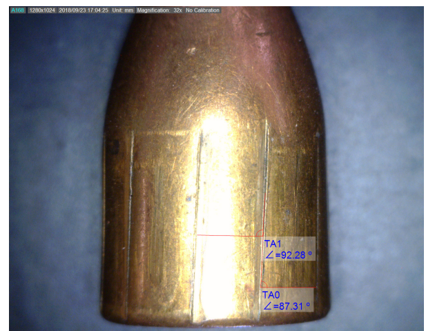
Figure 6: Two digital measurements from Bullet B were acquired for the interior angle (the rifling angle) of 87.31° and the exterior angle of 92.28°.