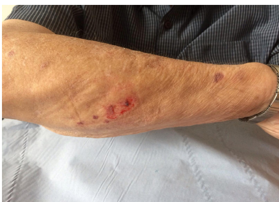
Figure 2: Laceration on right forearm.

This was not tender to touch, and did not extend proximally past the elbow. A 3cm laceration was present on the proximal forearm, with a small skin flap with no evidence of skin colour change, increased temperature or obvious infection (Figure 2).