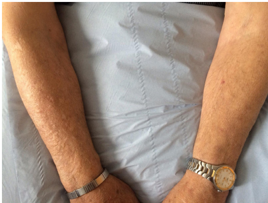
Figure 1: Patient's arms on presentation.

On examination he was systemically well and afebrile, with a heart rate of 56bpm and blood pressure 112/58mmHg. Respiratory rate was 16/min with an oxygen saturation of 96% on room air. General examination was normal. Clinical examination of the right forearm revealed no swelling or erythema, but there was a visible vesicular appearance of the skin on the dorsal aspect. Subcutaneous crepitus was felt on palpation (Figure 1, Video 1).